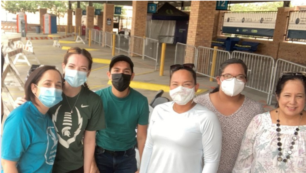
ProBAR assists migrants at the Brownsville bus station | Summer 2021