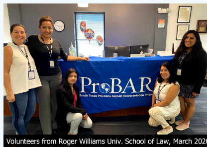
Volunteers from Roger Williams Univ. School of Law, March 2020

ProBAR is recruiting volunteers to extend the reach of our services for immigrants in the Rio Grande Valley. If you are an attorney interested in working on migrants' cases pro bono, please fill out our Pro Bono Interest Form . If you are passionate about providing crucial translation support to migrants, please fill out our Remote Translation Program Interest Form . If you have any questions, please contact us at volunteer@abaprobar.org .