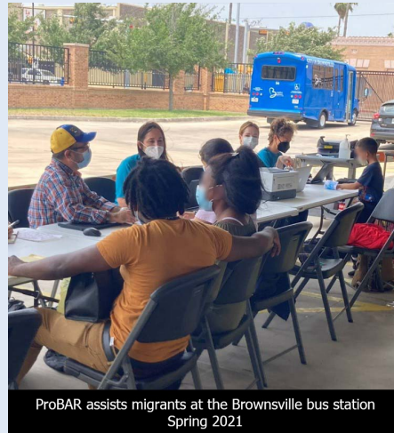
ProBAR assists migrants at the Brownsville bus station Spring 2021

However, in August 2021 a federal district court enjoined the termination of the MPP program. This means that the Biden Administration was ordered to reinstate the program. The reinstatement first affected other areas of the border, including El Paso and San Diego, before officials began to enroll asylum-seekers in our region in mid- to late-January.