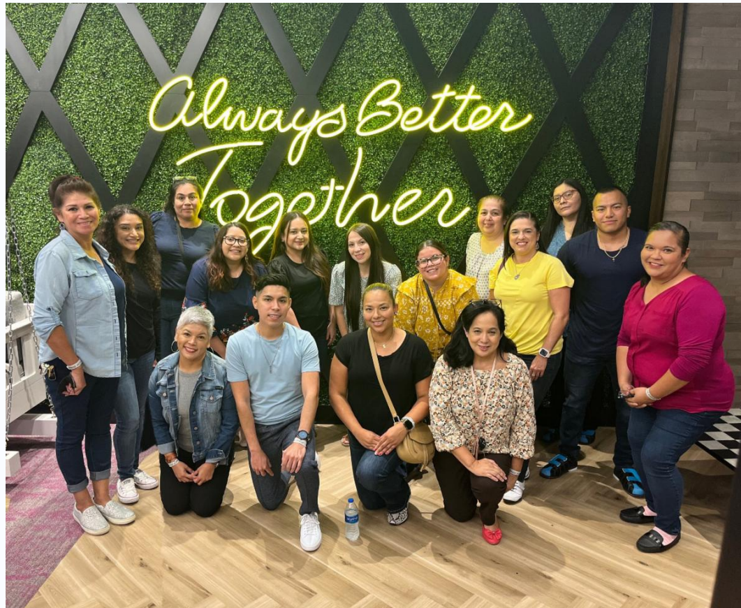
Pictured: ProBAR Release Support Team.

As 2022 draws to a close, some of our ProBAR staff have shared photos and reflections from the year - including memorable moments or aspects of their work that have inspired gratitude.